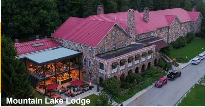
Mountain Lake Lodge