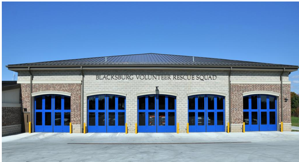
Blacksburg Volunteer Rescue Squad opened in 2016

The Rescue Squad maintains state-of-the-art rescue equipment that includes advanced life support ambulances, first response vehicles, specialty technical rescue vehicles, and technical rescue trailers to facilitate full spectrum special operations. As the sole entity tasked with all aspects of technical rescue, the Rescue Squad has established a Special Operations Division that specializes in technical rescue operations such as high angle, confined space, trench, emergency police operations, vehicle extrication, swift water, dive, basic structure collapse, wilderness search and rescue, and cave rescue operations. The Rescue Squad consistently meets or exceeds the nationally accepted standards for response times, membership certification, and professional conduct.