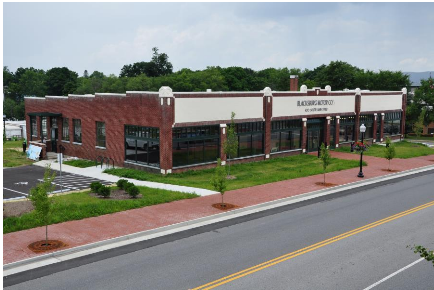
Blacksburg Motor Company Building, Certified LEED Platinum

The Town owns many historic buildings, which can present unique maintenance challenges. Several public buildings including the Municipal Building, the Bennett House, Old Town Hall, and the Community Center are slated for future renovations. The Alexander Black House as well as St. Luke and Odd Fellows Hall provide additional Downtown public meeting and gathering space. Other community parks, facilities, and spaces are detailed in the Parks & Recreation chapter and the Economy & Employment chapter.