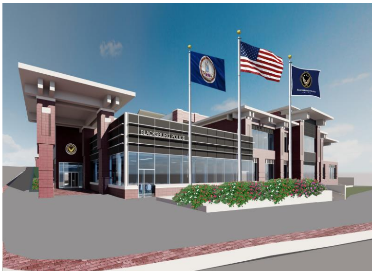
Artistic Rendering of New Public Safety Building

The Blacksburg Police Department currently operates from one station located at 200 Clay Street SW. A new public safety building with an integrated parking garage is planned for the Midtown development at 200 Clay Street SE. The building will house the Police Department in a visible location that is intended to represent a focus on accessibility for the whole community. This facility will provide a public gathering room along the Clay Street frontage to serve as a resource for community groups such as scouts, support groups, and other local initiatives. The new building will also include space for holding trainings, which the current location cannot accommodate. The structure is slated for completion in Spring 2022.