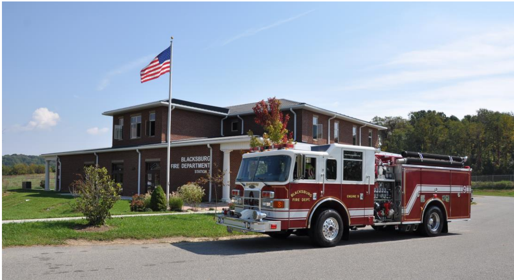
Blacksburg Fire Department: Station 3

The Blacksburg Volunteer Fire Department protects the Town of Blacksburg, Virginia Tech, and the area of Montgomery County surrounding the Town. The department provides services such as public fire education, inspections, fire prevention, fire suppression, fire investigations, and hazardous materials containment. The Fire Department operates as a volunteer organization with only two career firefighters, which poses a challenge when the department must respond to routine calls during the day when many volunteers are at work or in class. Fortunately, the Fire Department has a core group of community members with years of experience who provide a continuity of service that balances the high turnover rate of student volunteers, who generally leave after two to three years of service.