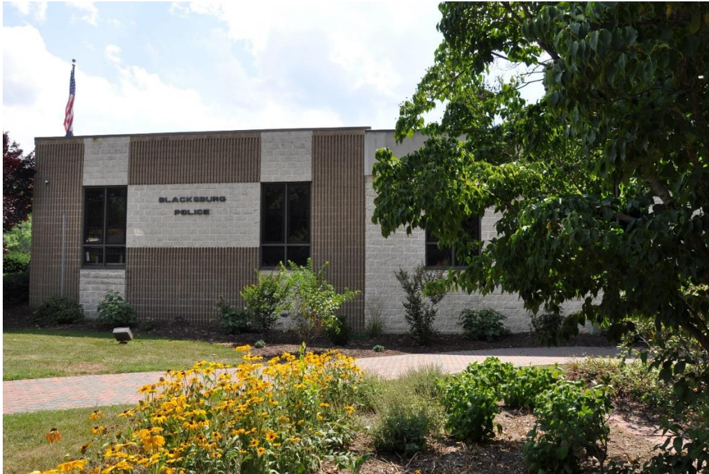
Blacksburg Police Department

center delivers coordinated dispatch that is more operationally efficient and provides improved response time that was previously lost due to transferring calls between jurisdictions.