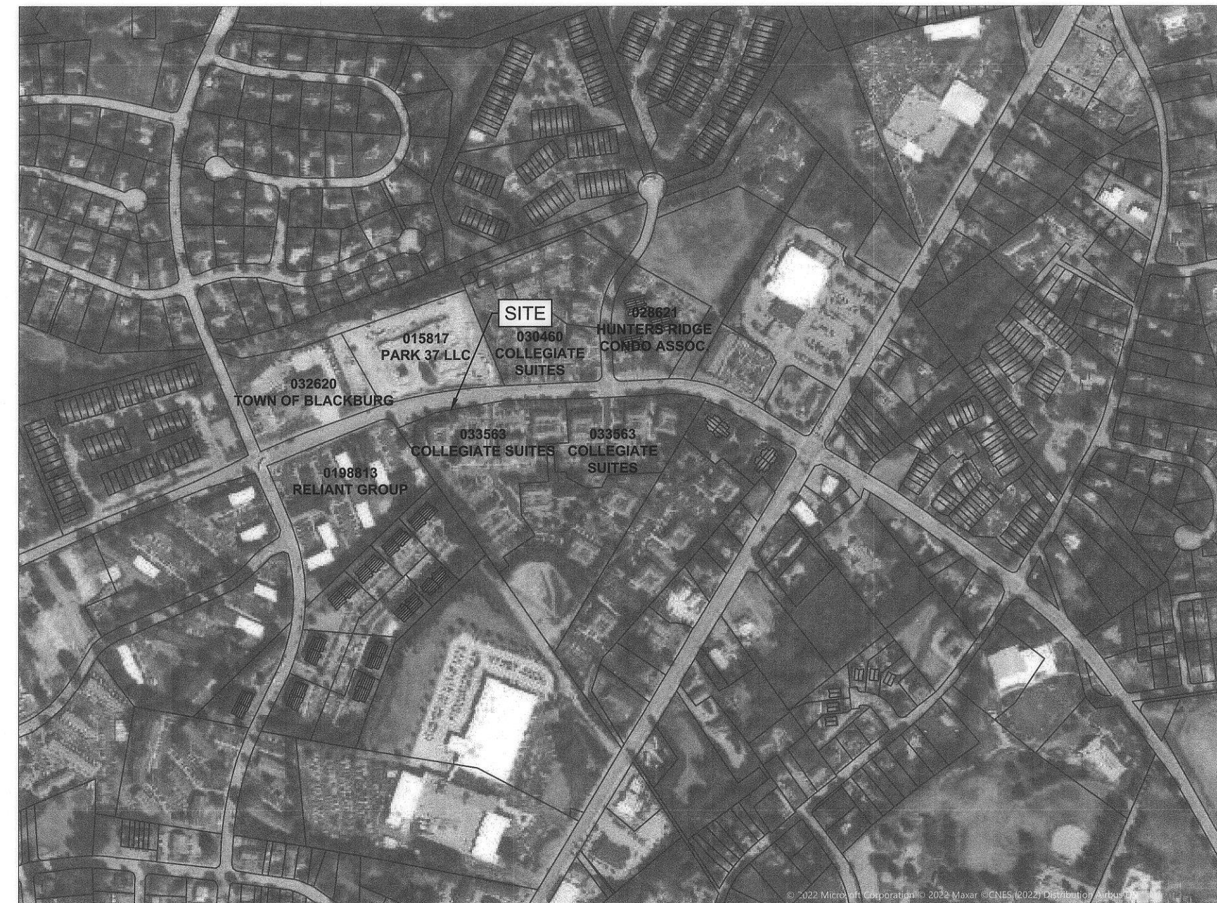
LOCATION MAP SCALE: 1" = 500'

TAX MAP NUMBER (PRIMARY): RIGHT-OF-WAY PARCEL NUMBER (PRIMARY): RIGHT-OF-WAY PLAT & BOOK PAGE (PRIMARY): RIGHT-OF-WAY TAX MAP NUMBER (SECONDARY): 196-10 2 PARCEL NUMBER (SECONDARY): 033563 PLAT & BOOK PAGE (SECONDARY): 0016-0712 CURRENT PARCEL ADDRESS: RIGHT-OF-WAY 1201 PATRICK HENRY DR NW TOTAL PARCEL AREA: N/A (RIGHT-OF-WAY) AREA OF DISTURBANCE: 0.1 AC (4,360 SF) EXISTING IMPERVIOUS COVER: 0.04 PROPOSED IMPERVIOUS COVER: 0.07 FLOODPLAIN INFORMATION: FIRM PANEL 51121C0131C EFFECTIVE DATE: SEPTEMBER 25, 2009 APPLICABLE ZONE: ZONE "X" OUTSIDE REGULATORY FLOODPLAIN ZONING DISTRICT: PR PLANNED RESIDENTIAL ADJACENT ZONING DISTRICT: RM-48 MEDIUM DENSITY MULTIUNIT RESIDENTIAL PRESENT USE: BUS-STOP PROPOSED USE: BUS-STOP