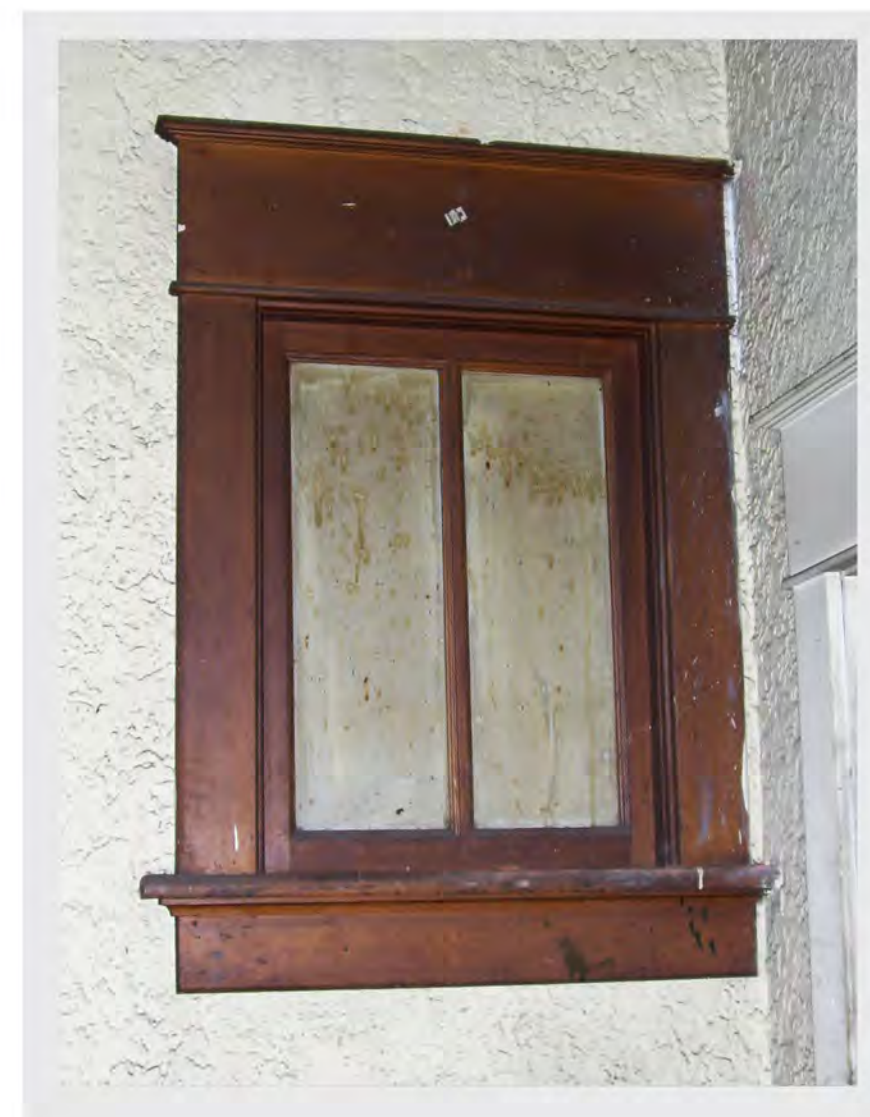
HISTORIC WOOD WORK