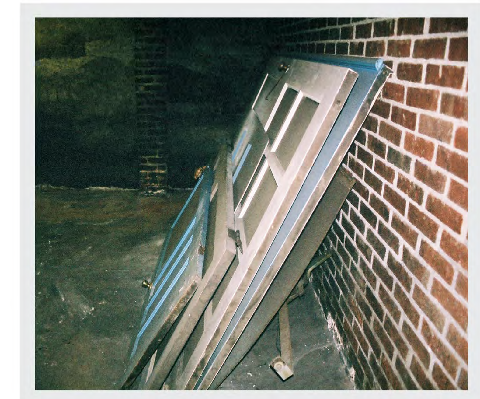
HISTORIC DOORS REFINISHED AND REINSTALLED