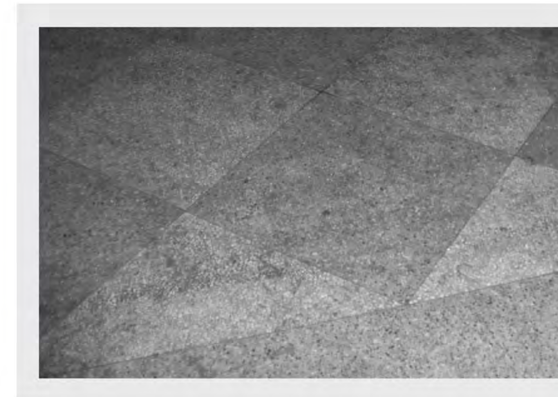
ORIGINAL TERRAZZO FLOORS