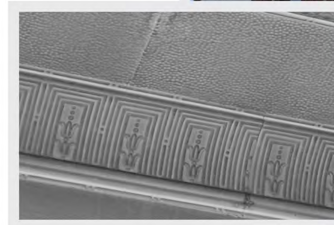
DECORATIVE TIN CORNICE AND CEILING