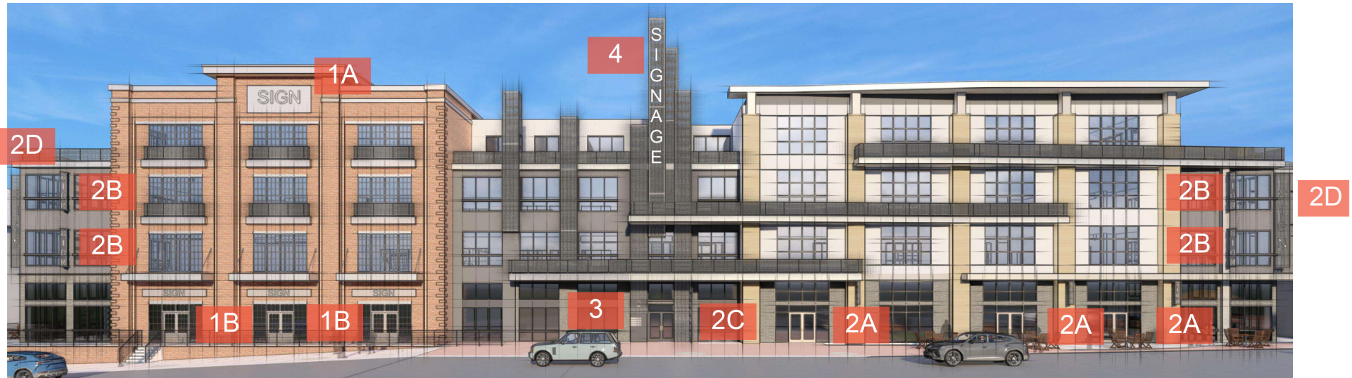
DC 2 South Main Street Elevation