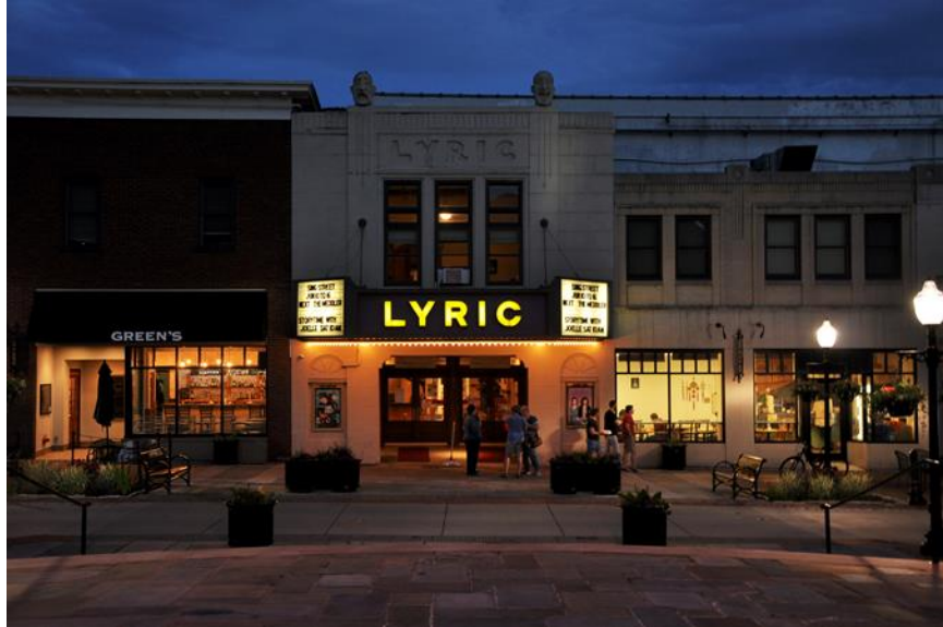
The Historic Lyric Theatre

The Community Arts Information Office (CAIO) is located in downtown. St. Luke and Odd Fellows Hall and the Blacksburg Museum, located in the renovated Alexander Black House, promote the cultural history of the Town. An Arts Collaborative has been formed to support the arts in Town under the leadership of the Blacksburg Partnership. The Partnership also facilitated discussion amongst local artists – visual artists, writers, musicians, and performers – to understand the needs of local artists, to promote local art and artists, and to increase public awareness of community art. Based on these Artist Coffeehouse discussions, additional performance space to meet local demand is recognized as a need within the Town. Also active is the Blacksburg Regional Art Association comprised of local artists, many of whom participate in the Round the Mountain Artisan Trail. Downtown Blacksburg, Inc. is increasingly sponsoring special events that highlight the arts in Downtown Blacksburg. The Crooked Road connects regional music venues in southwest Virginia to promote the region’s rich heritage of traditional music. Market Square Park hosts the Market Square Jam for local musicians as an affiliated venue of the Crooked Road trail.