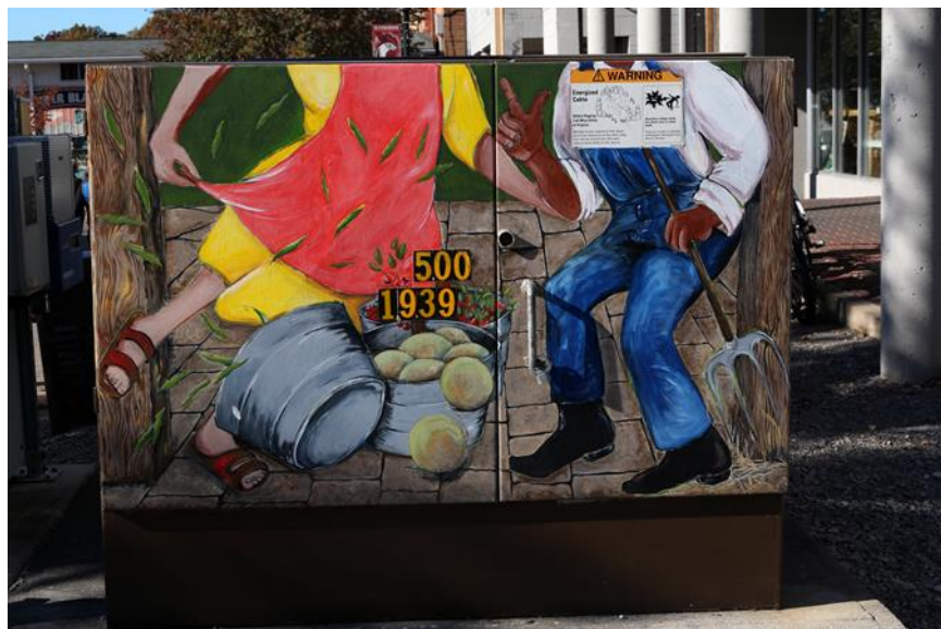
Market Square Park Electrical Box Art titled “Dancing With Vegetables” by Nikki Pynn

The Community Arts Information Office (CAIO) is located in downtown. St. Luke and Odd Fellows Hall and the Blacksburg Museum, located in the renovated Alexander Black House, promote the cultural history of the Town. An Arts Collaborative has been formed to support the arts in Town under the leadership of the Blacksburg Partnership. The Partnership also facilitated discussion amongst local artists – visual artists, writers, musicians, and performers – to understand the needs of local artists, to promote local art and artists, and to increase public awareness of community art. Based on these Artist Coffeehouse discussions, additional performance space to meet local demand is recognized as a need within the Town. Also active is the Blacksburg Regional Art Association comprised of local artists, many of whom participate in the Round the Mountain Artisan Trail. Downtown Blacksburg, Inc. is increasingly sponsoring special events that highlight the arts in Downtown Blacksburg. The Crooked Road connects regional music venues in southwest Virginia to promote the region’s rich heritage of traditional music. Market Square Park hosts the Market Square Jam for local musicians as an affiliated venue of the Crooked Road trail.