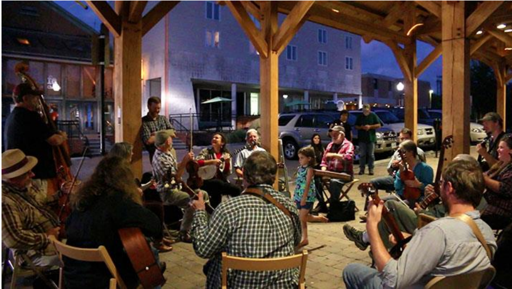
Market Square Jam at Market Square Park

and supports the Town’s commitment to placemaking. The Market also provides a multitude of opportunities for the Town to partner with other entities for these events.