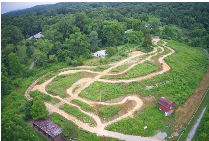
Aerial View of Mountain Bike Skills Park

related to the arts and the outdoors and can be advanced with regional partnerships. In addition to partnering with regional entities for tourism, the Town has invested in wayfinding and infrastructure to strengthen the sense of community and place. In the Comprehensive Plan Survey, mountain location was the top answer for what respondents like most about Blacksburg. The Town also has the potential to become a base camp for outdoor enthusiasts who want to take advantage of the great natural resources of the region such as the Blue Ridge Parkway, the New River and the Appalachian Trail. Investment in outdoor related tourism, such as the Huckleberry Trail extension, the Mountain Bike Skills Park, and the Brush Mountain Trail System, will help to realize this potential. In addition to the beautiful natural setting, Blacksburg hosts many well-established events and festivals, making it an attractive destination within the New River Valley region and greater Southwest Virginia.