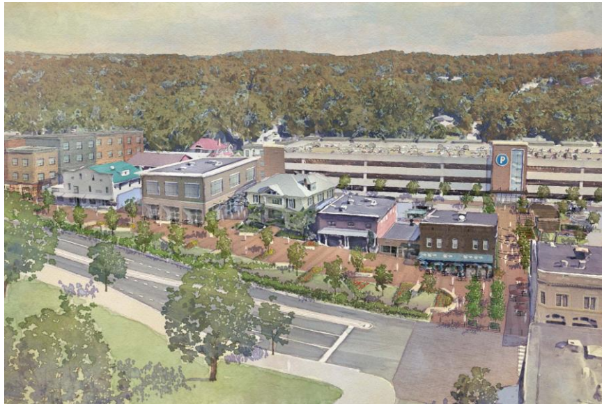
Illustrative vision for Central Downtown, 2019 Downtown Strategic Plan

The Town hired the firm of Development Strategies to study the challenges and opportunities for the area and develop recommendations for how to ensure Downtown becomes a dynamic, active, and accessible neighborhood with a diverse economic base. Rooted in community input and analysis, the 2019 Downtown Strategic Plan provides a blueprint for action through policy, capital improvements, and development that advance community priorities. Downtown is broken into six distinct districts in the Plan. Each district's assets and opportunities have been evaluated and a unique vision for each is illustrated in the Plan. Implementation of the Plan is underway and will address the six districts over the next 10-15 years.