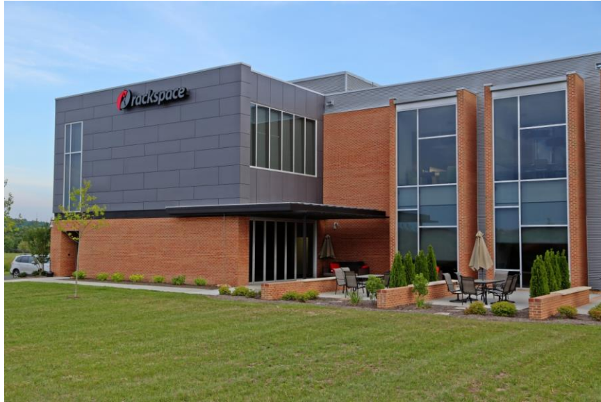
Office building in the Virginia Tech Corporate Research Center

The CRC provides a campus environment that can accommodate multiple business sizes and configurations. The Town has also seen increasing demand for office space in the Downtown for research and development employers that wish to be more walkable to Downtown amenities. In the past several years, the Town has seen growth in the office square footage provided in smaller uses in the Downtown.